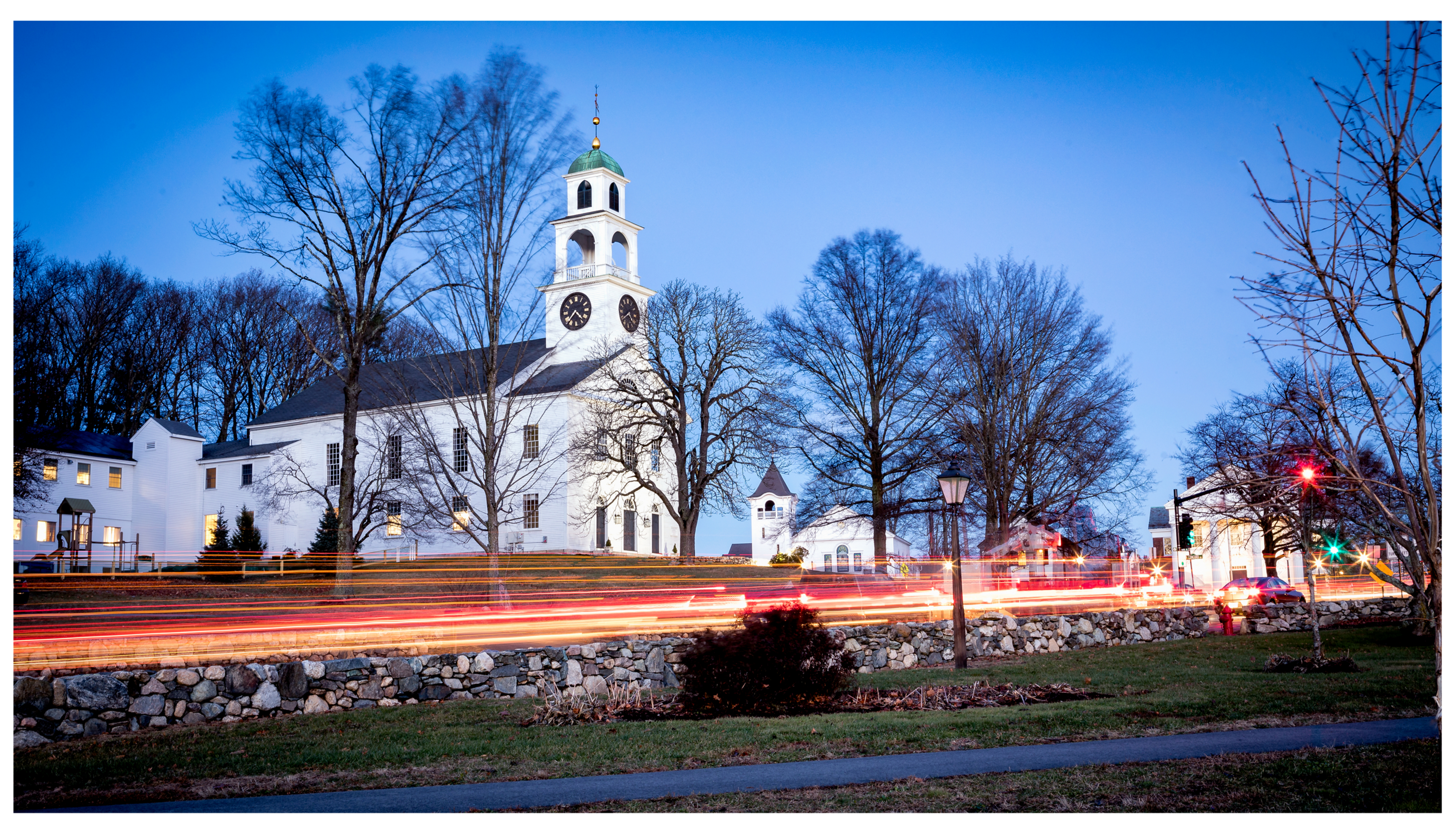
Town Center Today. Population: 15,390 -18,697

The town once known for farming, becomes an exclusive Boston suburb. The increasing population means more and larger homes, more school renovation and expansion, recreation areas, stores, businesses and houses of worship. While the town is concerned with planning for its future, it is also aware of the need of preserving its past.