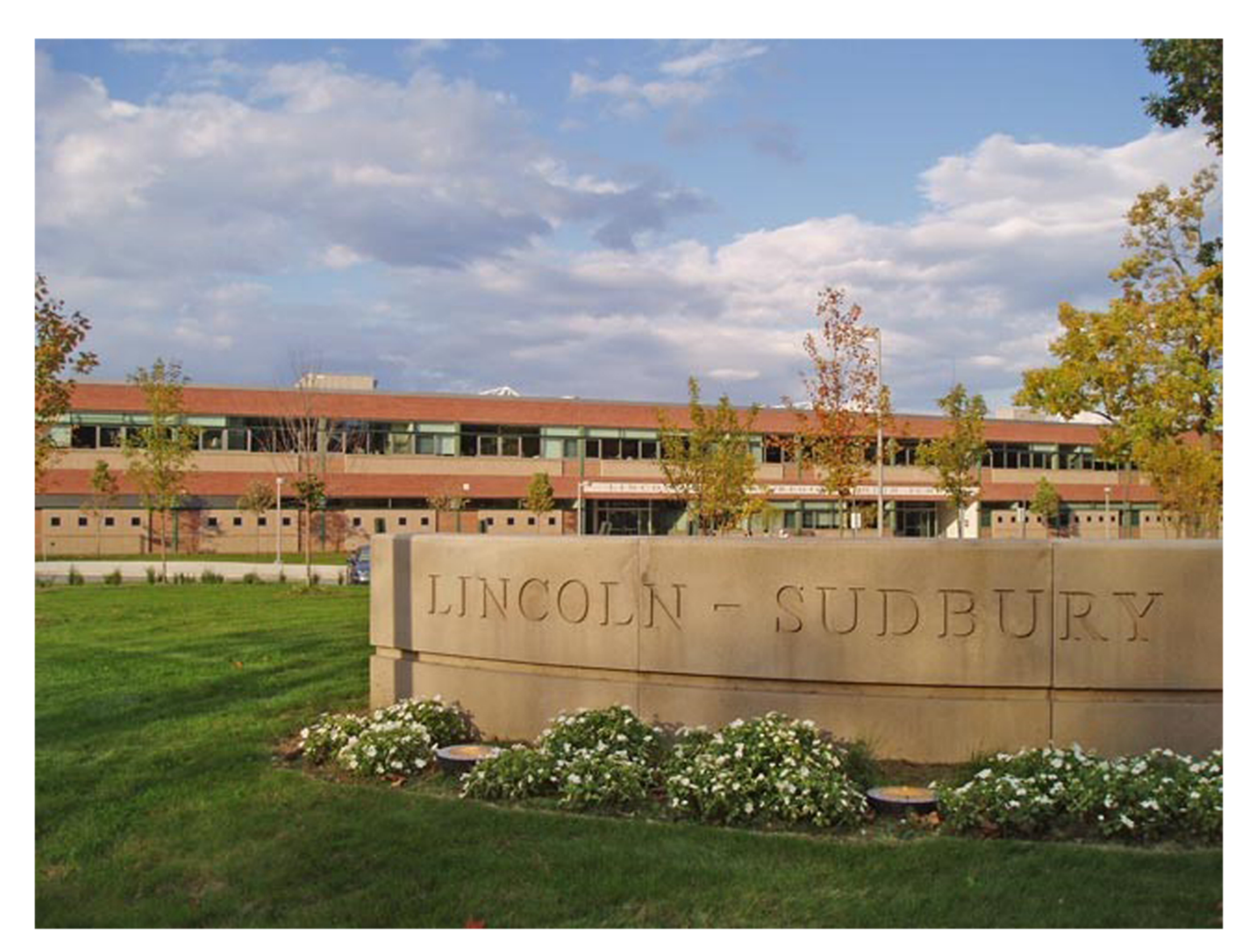
Lincoln Sudbury Regional High School

The town once known for farming, becomes an exclusive Boston suburb. The increasing population means more and larger homes, more school renovation and expansion, recreation areas, stores, businesses and houses of worship. While the town is concerned with planning for its future, it is also aware of the need of preserving its past.