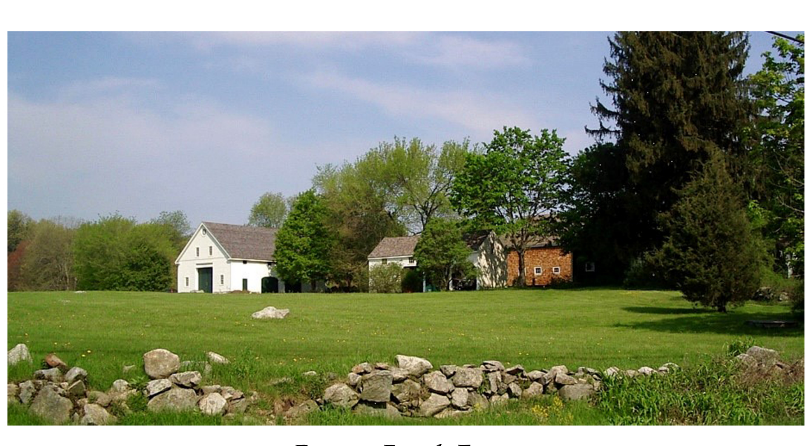
Pantry Brook Farm

The success of these efforts were made possible families in town, the Town of Sudbury, the Sudbury Valley Trustees, the Commonwealth of Massachusetts and the Federal Government.